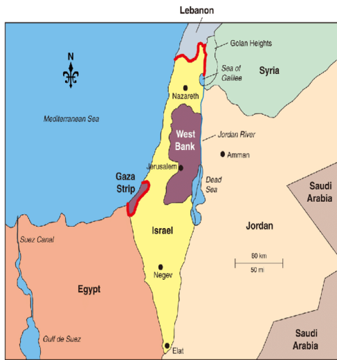
Legend for the map: Israel (yellow), Gaza and West Bank (purple), Egypt (orange), Lebanon (light blue), Syria (green), Jordan (tan), Saudi Arabia (grey), Water (blue). Red line indicates national borders with tunnel activity.