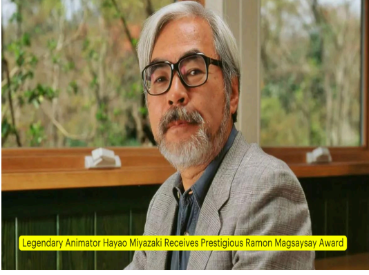
Legendary Animator Hayao Miyazaki Receives Prestigious Ramon Magsaysay Award