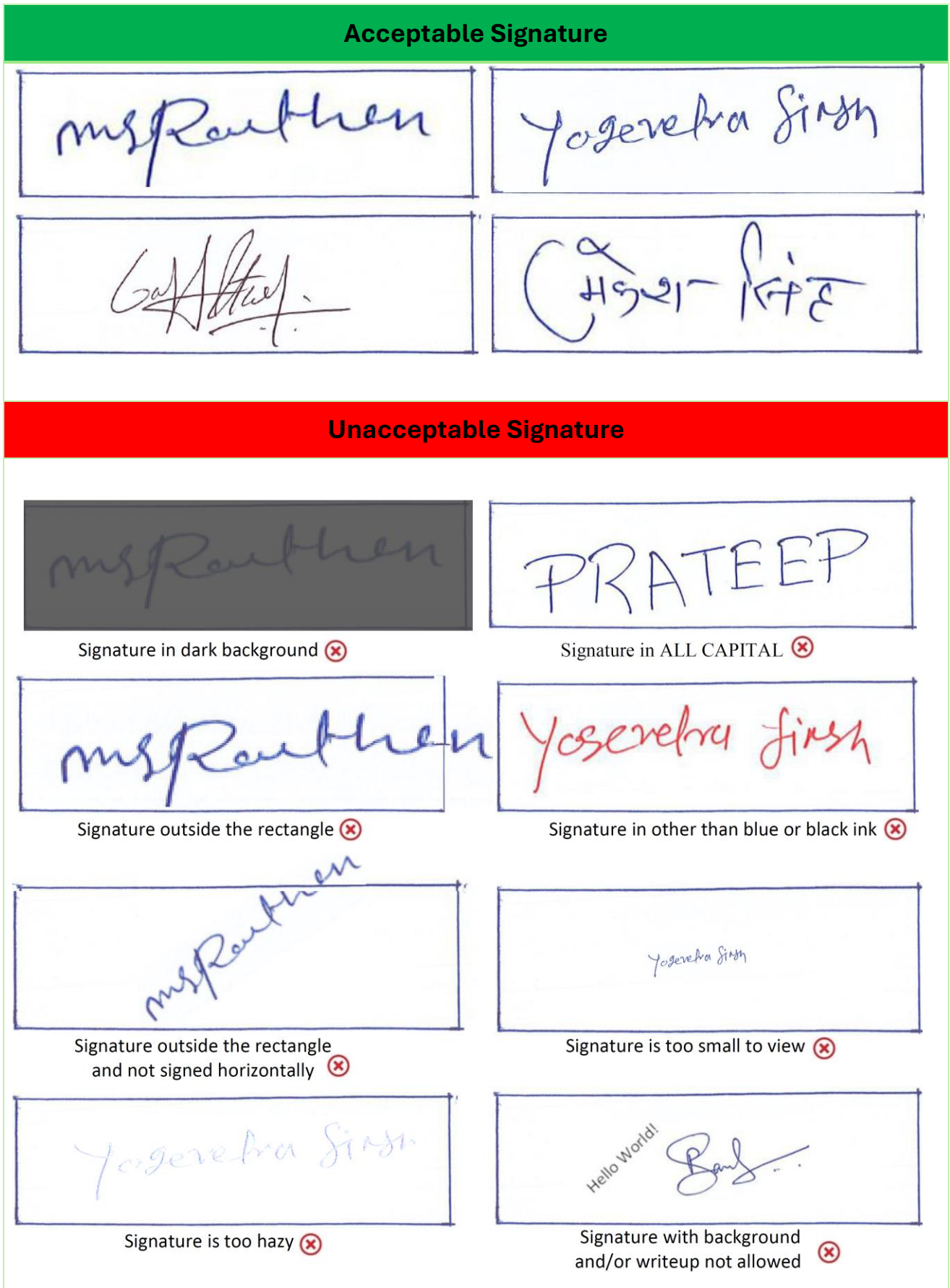
Table 10: Samples of acceptable and unacceptable signatures