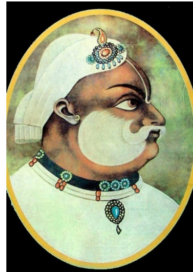
MAHARAJA SURAJMAL (1707–1763)

Maharaja Surajmal , son of Raja Badan Singh, fought for the protection of our country and was born on 13 th February 1707. This is the same date in history as the day when Aurangzeb died. King Surajmal is taken with great pride among the kings who have a special place in north India for giving a befitting reply to the invasion of the Mughals. He was a skilled administrator, visionary, and a wealthy emperor of diplomacy. Surajmal had become everyone's favourite in Brij Pradesh due to his bravery from adolescence. Maharaja Surajmal united the Jats under his banner and fought many battles to maintain the hegemony of the Jats.