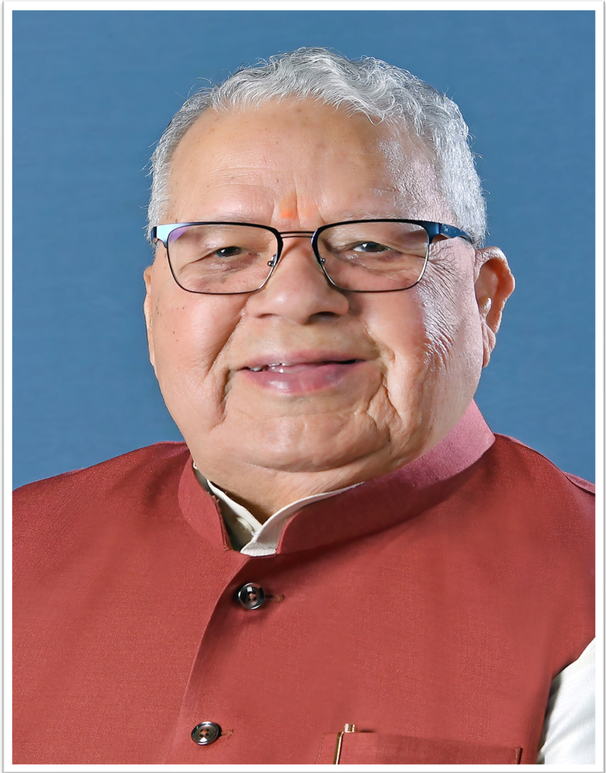
Shri Kalraj Mishra Hon'ble Governor of Rajasthan & Chancellor Maharaja Surajmal Brij University