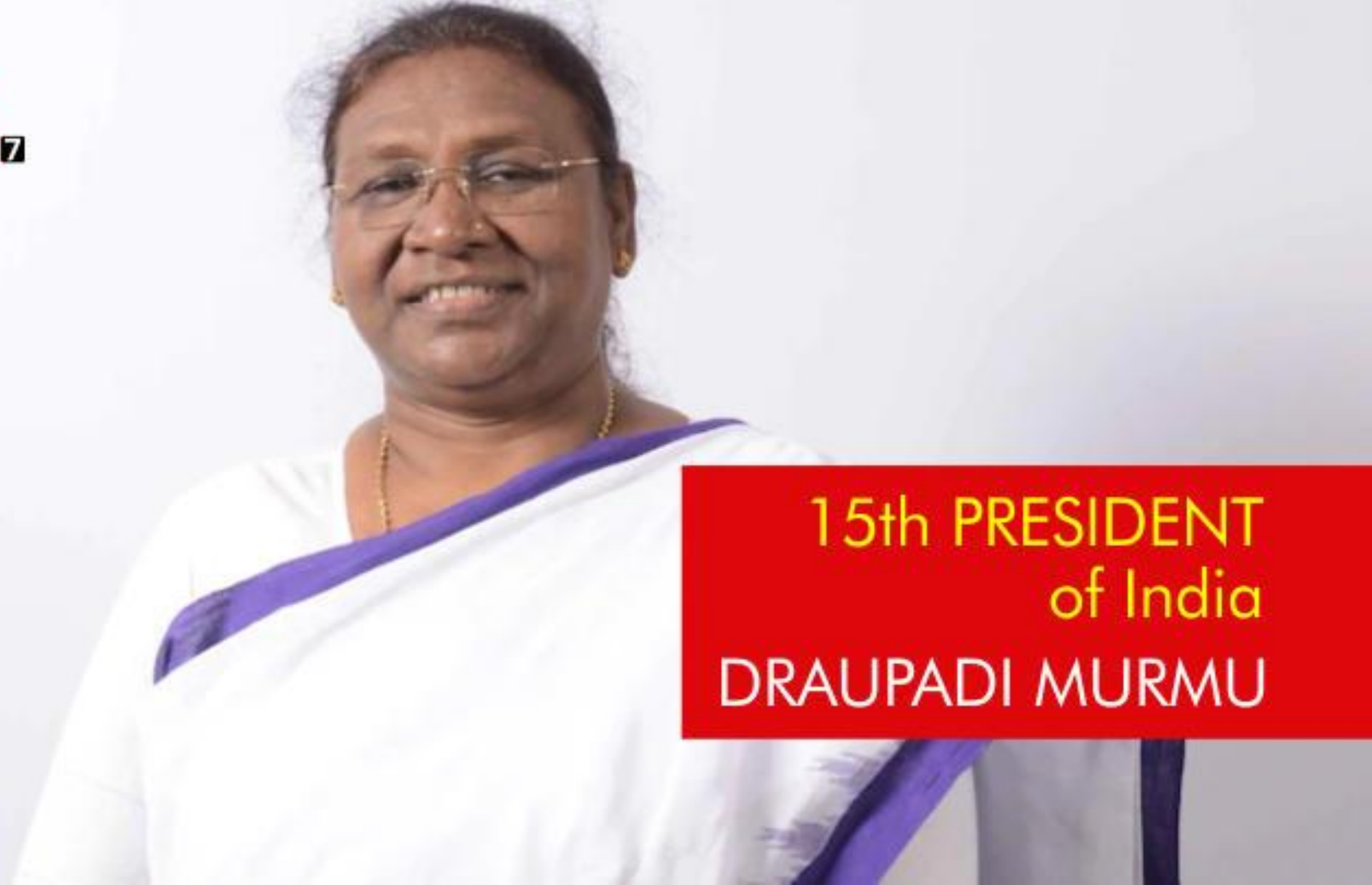
15th PRESIDENT of India DRAUPADI MURMU