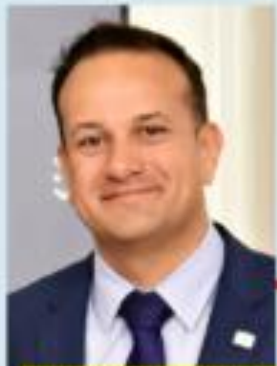
Ireland's Leo Varadkar

Varadkar (aged 43), who is of Indian origin and openly gay , is still one of Ireland's youngest ever leaders , even in his second stint in the role.