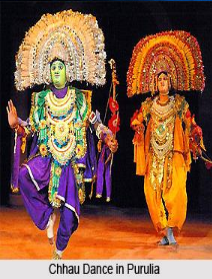
Chhau Dance in Purulia

Sangeet Natak Akademi has recognised 8 classical dance forms: