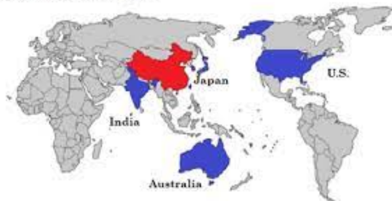
The “Quad” Counter to China