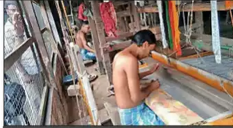
(L) Kalo Nunia rice variety; (R) Tangail weavers of Nadia

Five items that have been recognized for the GI tag | Sundarbans' natural honey, Jalpaiguri's Kalo Nunia rice and Murshidabad and East Burdwan's Garad and Korial and Nadia's Tangail sarees