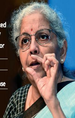
Union Finance Minister Nirmala Sitharaman addresses the media after the GST Council meeting