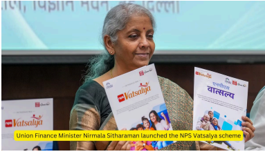
Union Finance Minister Nirmala Sitharaman launched the NPS Vatsalya scheme